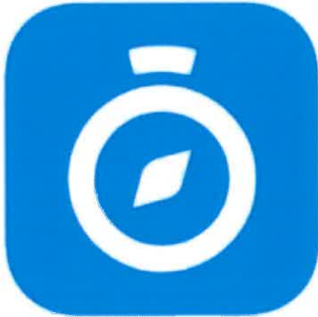
Compass Parent Portal App

Attached to this newsletter, is the help sheet to download the Compass Parent Portal. We would strongly encourage you to download this app as the Term 4 Semester 2 Reports will be uploaded to the app. There will be no paper copies sent home with students. All notifications will be sent through via the parent portal. If you require further assistance, please call the school office on 9836 7100.