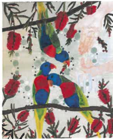
Good Shepherd Totem - Rainbow Lorikeet