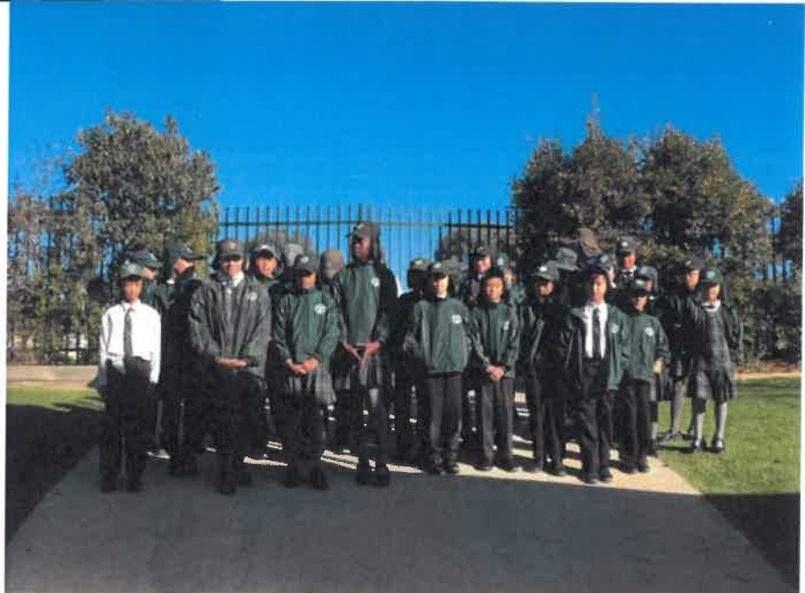
Our star athletes who went to Zone Athletics last week